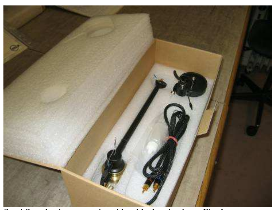
Stogi S packaging: armtube with cable, bearing base. Fig. 1

Armbase for other turntables with accessories (3x hex screw and nuts, Allen key 1.5, 3mm), mounting protractor, fingerlift for headshell.