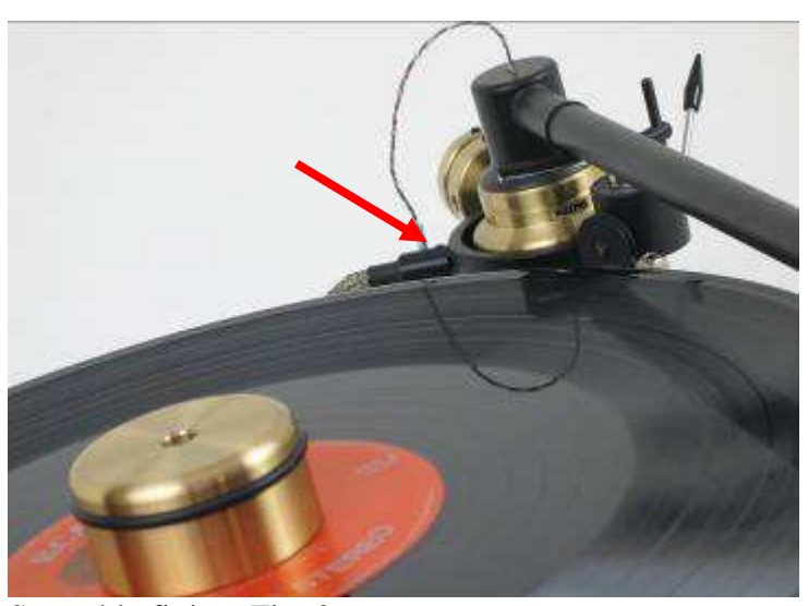
See cable fixing. Fig. 3.

If Stogi S is mounted on other turntables, move the tube by hand towards the spindle as if in an 'inner groove' position and ensure there is enough clearance for the rod and counterweights. If not, consult your dealer.