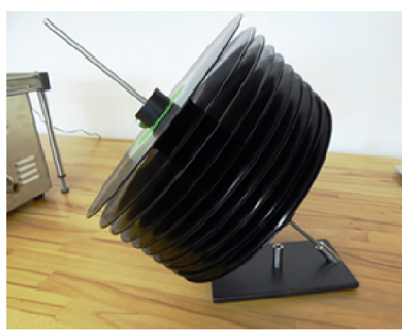
Spindle with records in drying position