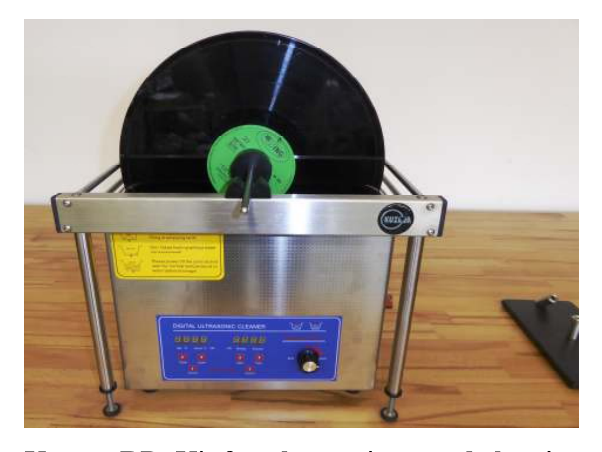
Kuzma RD Kit for ultrasonic record cleaning (ultrasonic cleaner bath is not supplied with kit)