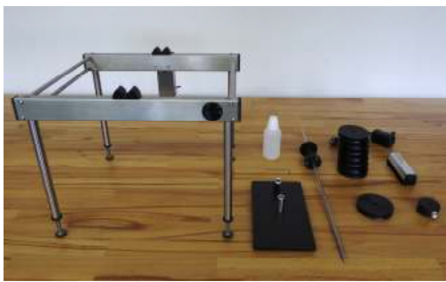
RD kit (rotating and drying)- kit assembled for use

The RD kit comprises of frame with motor, supporting legs, spindle for holding records, record spacers, a clamp for fixing records on the spindle and a stand for drying records. Most parts are made from stainless steel. In the kit small bottles of isoproply alcohol and wetting agent are also included as well as a carbon fibre cleaning brush and DC power supply for motor. Kit assembly requires only ten minutes and a meduim size Philips screwdriver.