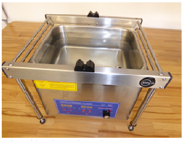
Ultrasonic cleaner bath- typical sample