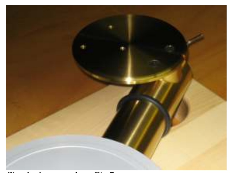
Circular brass armbase Fig 7.

The Rega RB 300 tonearm can fit directly into the hole in the brass pillar. The hole in the brass pillar should be turned away from the platter bearing and a thin tube inserted over the tonearm's base. Finally the tonearm should be fixed by an Allen key into the brass pillar.