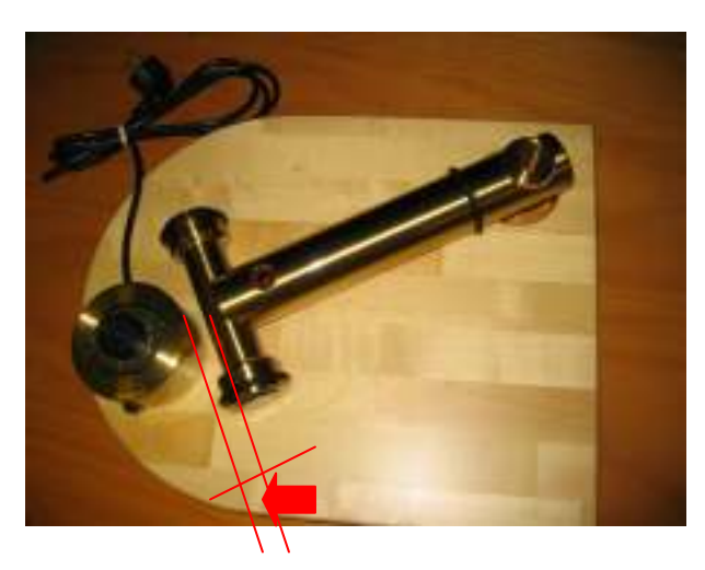
Position T base + motor tower Fig 6.

Remove the foam and lift the main T base (Fig. 3) of turntable carefully as it is heavy and put it on a shelf so that the side with the bearing is situated at 8 o' clock and the side with the tonearm mount at 2' o clock. See Fig 6.