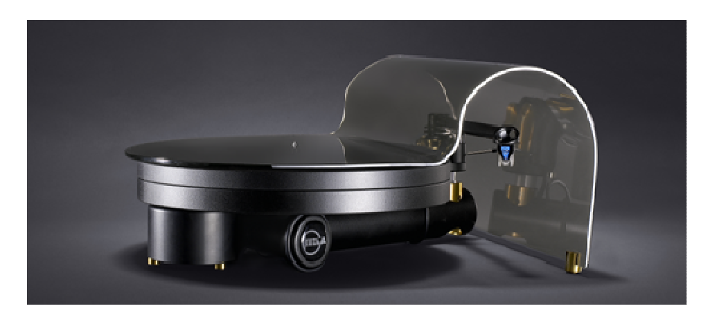
Platter S kit