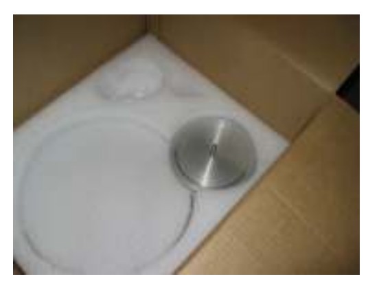
Unpacking: subplatter Fig 4.