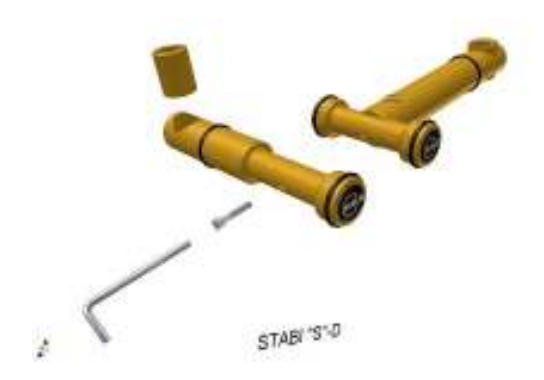
Second tonearm SD kit

Upgrades: adding second tonearm adaptor, power supply or 12 inch version tonearm are available, as well extra platter: