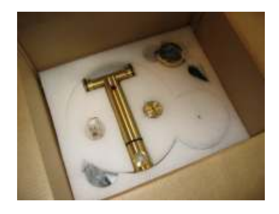
Unpacking: T base and parts Fig 3.

Stogi S tonearm with its own accessories Clamp (in box- see Fig 3) Wooden platform (on top of the box)